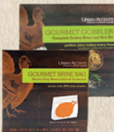
URBAN ACCENTS COMPLETE TURKEY BRINE KIT & BPA-FREE BRINE BAG KIT: $12.99 / BAG: $3.99