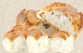
PARKER HOUSE ROLLS (Plain, Cheddar, Onion-Poppy & Honey-Whole Wheat) & PANE PUGLIESE $4.99 6 PK OF ROLLS $4.49 PER LOAF