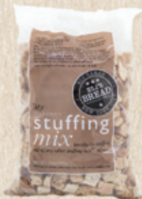
ELI'S BREAD ALL NATURAL STUFFING MIX $6.99 / 16 OZ